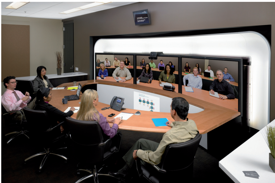
Unauthorized use not permitted.